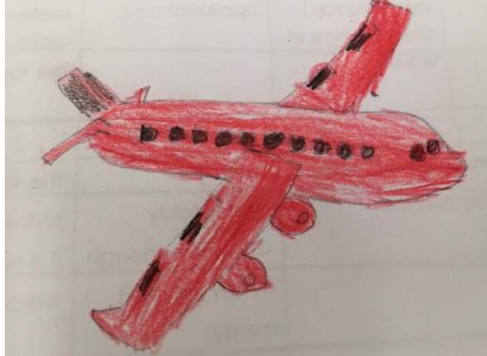
My Lovely toy

My mum gives me a present. It is a lovely toy. It is a planer. It is small. It is black and red. The plane has long wings and small windows. The wings are long. The windows are small. I love my toy. I play with my plane every day.